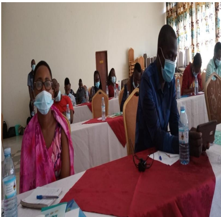
Human rights defenders attending the training for human rights activists at Collin hotel