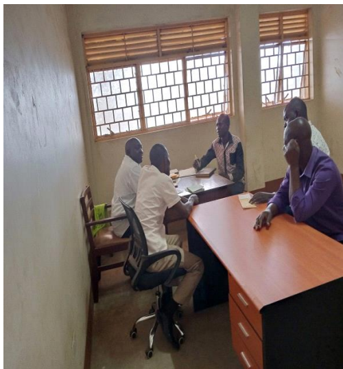
Having a meeting with the market leaders (CLO)