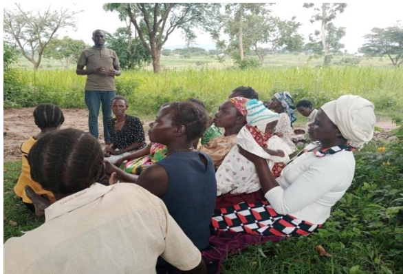
A community engagement on Domestic Violence women of Semero Cell With the residents of Industrial Division in Mbale City