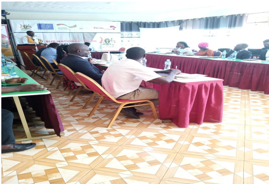
At the Eastern Region Youth Parliamentary Elections at Dream Palace Hotel-Mbale City