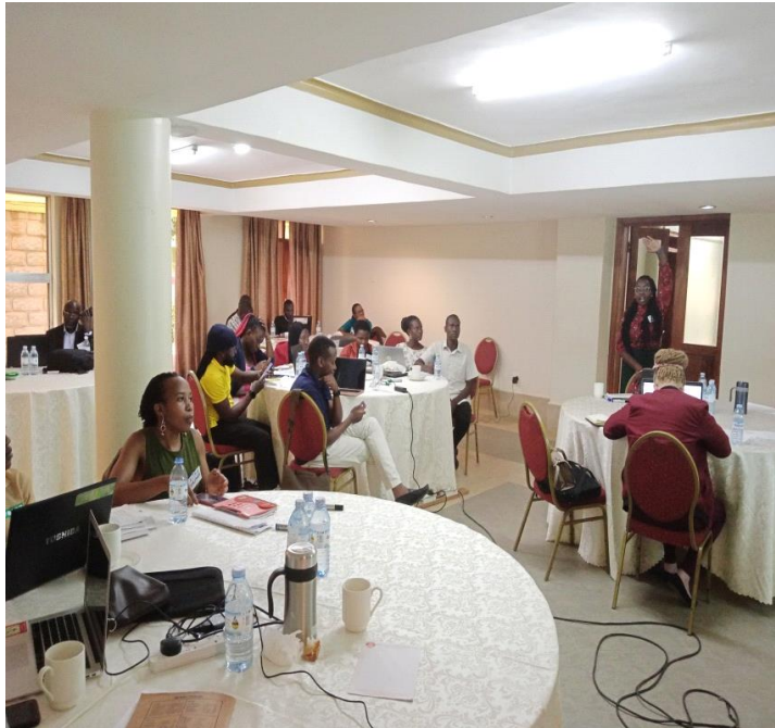
Outcome harvesting workshop at Esella Country Hotel Najjera