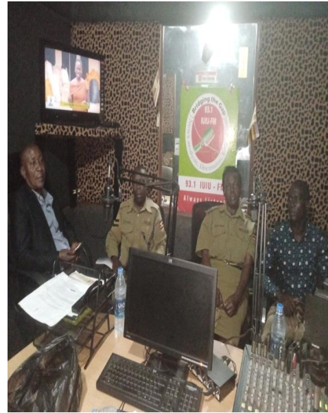
On IUIU Radio discussing Child crimes and crimes by boda boda Riders