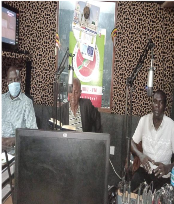
On IUIU Radio with the CLO Mbale City and the C/Person Taxi Drivers Association Far East