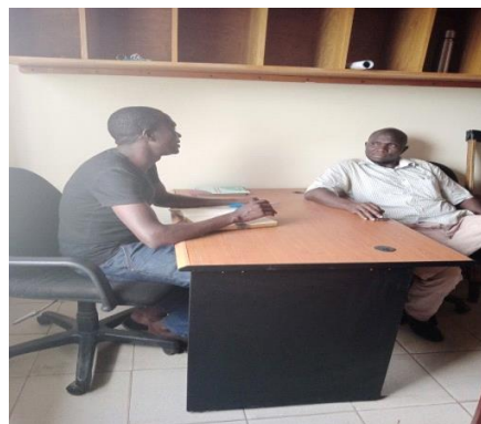
With the Chairperson of Mbale City Youth with Disability discussing some of the challenges encountered by PWDs