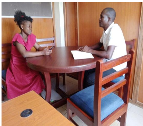
In a discussion with the team leader Of sex workers of one of the sex spot Within Mbale City Centre