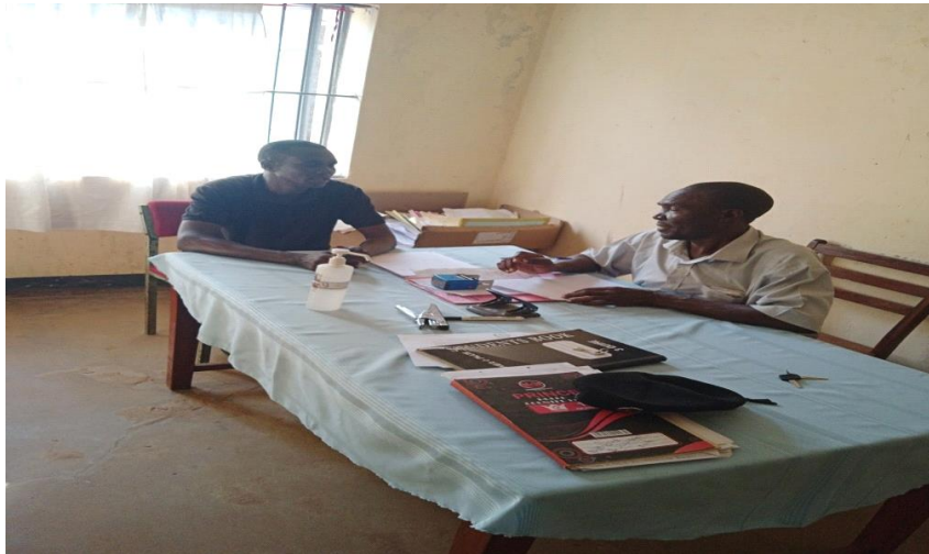
With the Community Liaisons Officer (CLO) Northern Division to plan for the next community engagement.