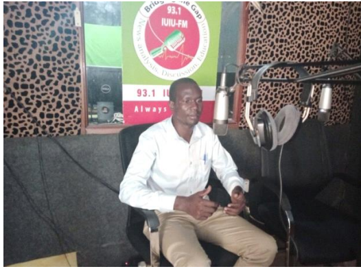
On IUIU Radio discussing issues of Domestic violence and theft Within Mbale City