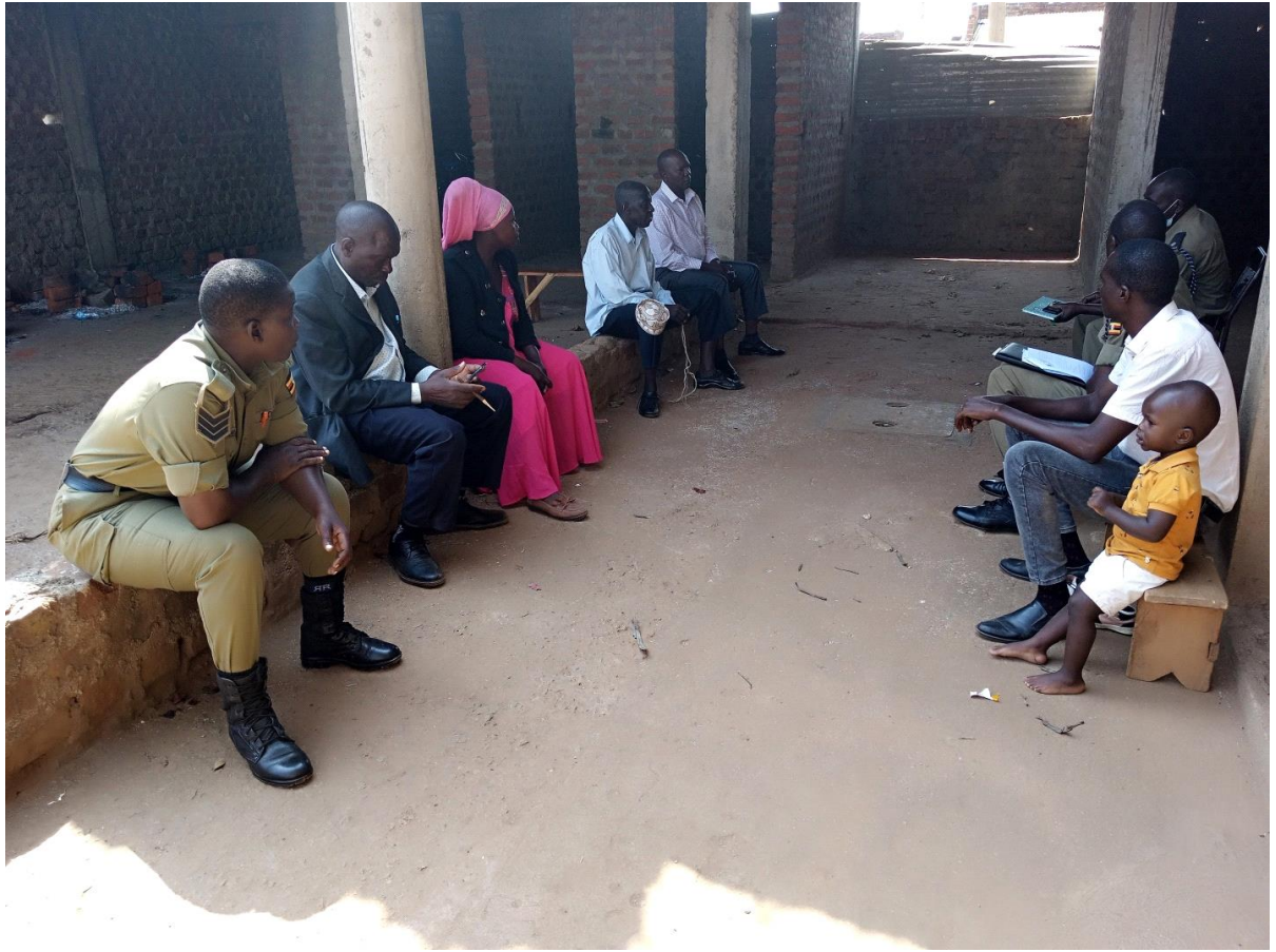
With the Community Liaisons Officer and police officers of Northern City Division Settling a family land conflict