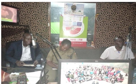
Radio Talk Show on Traffic update and Crime Rate with the RTO Elgon Region and OC CID CPS