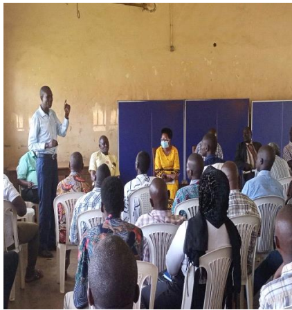
With the DRCC and the Local leaders of Northern City Division discussing various Security concerns of the residents and poor service delivery within the Division