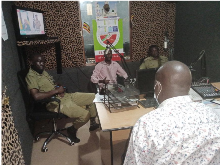
Live on IUIU Radio with the Community Liaison Officer (CLO) Northern Division and the Chairperson Taxi Drivers Association, Eastern Region discussing GBV in Mbale City.