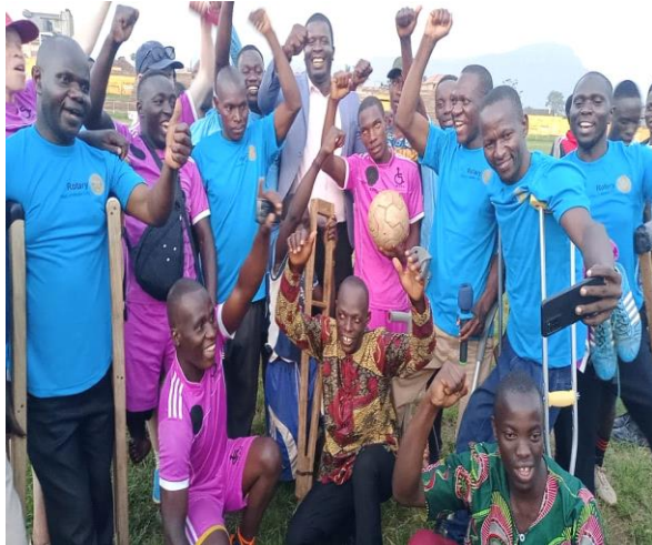
Mbale Union of Persons with Disabilities (MUPD) in Annual Talent Show At Mbale Municipal Stadium Photo Gallery