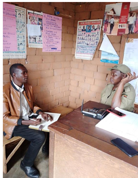
With the Community Liaisons Officer