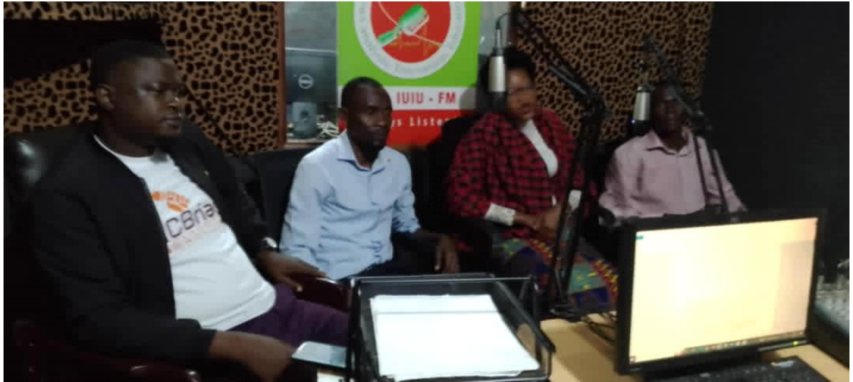
On IUIU Radio with the DRCC Northern City Div and Imbalu Culture Organizing Committee members discussing the Security and Health concerns during “Imbalu Cultural” Ceremony