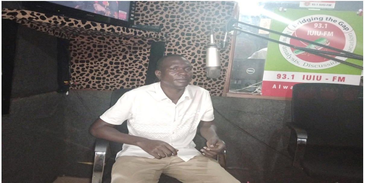
On a Radio Talk Show discussing land conflicts and poor waste management within Mbale City