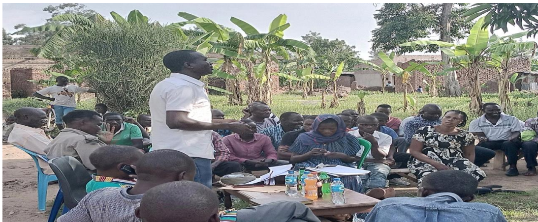
A community engagement with leadership and the residents Masaba Cell, Zabanyanya Ward, Industrial Division and discussed service delivery and security concerns of the residents.