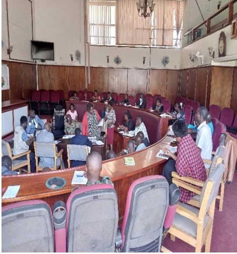
A meeting with the Mbale City leadership situation in Elgon and sebei Sub Regions and other agencies discussing interventions required towards victims of floods