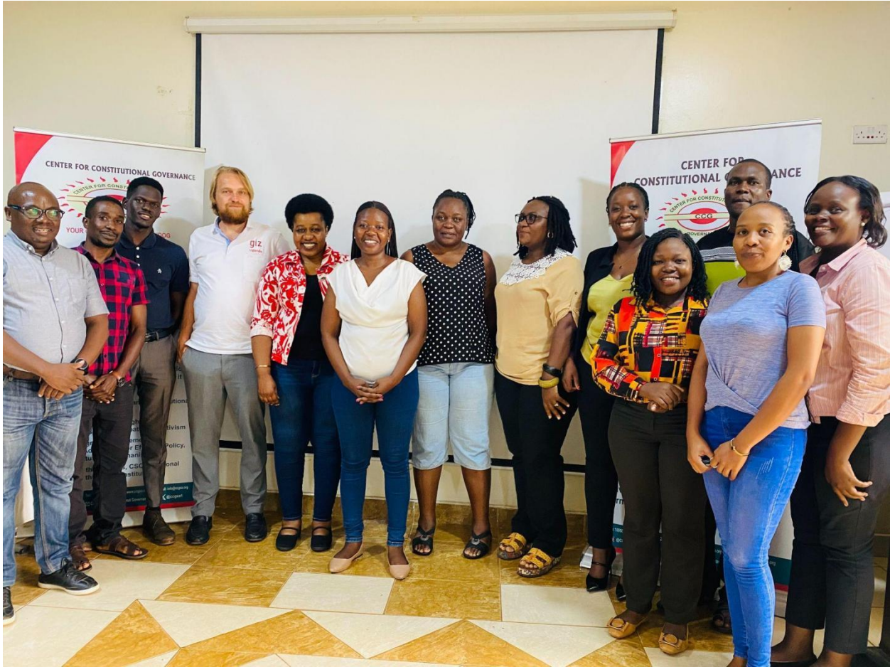
CCG staff with their trainers on the last day of the fundraising and resource mobilization training