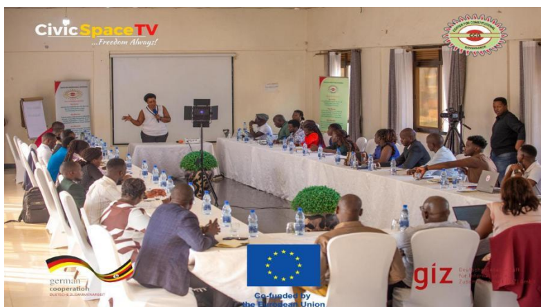
Representatives from various NGOs at the validation workshop

In October 2024, the NGO Bureau ceased to be an autonomous entity after its dissolution and integration as the Department of NGO Management in the Ministry of Internal Affairs as part of the Rationalization of Government Agencies and Public Expenditure (RAPEX) Policy of 2021. This has significantly impacted the activities of NGOs especially when it comes to issues such as renewal of licenses, etc.