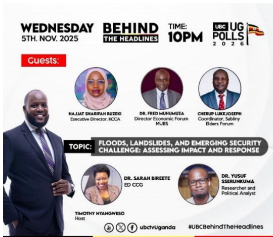
Through regular appearances on UBC TV's Behind the Headlines, CCG continues to shape public discourse on key national issues