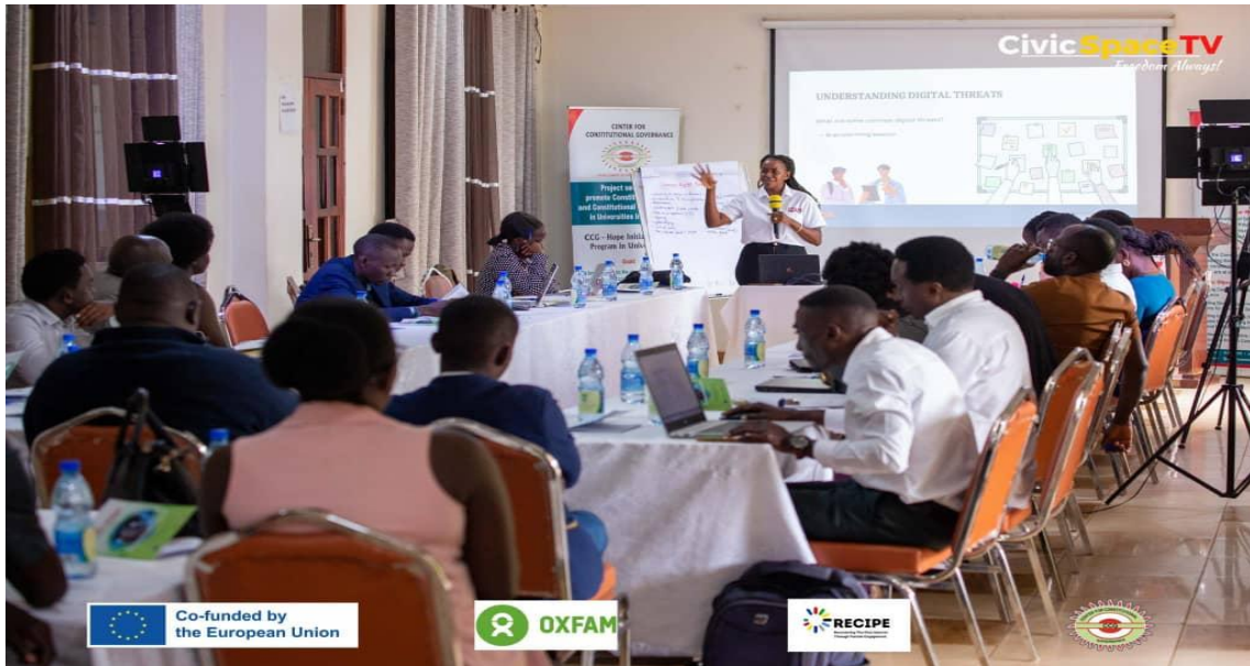
Participants at one of the trainings on digital rights and emerging technologies held in Kampala.

The trainings equipped civil society actors, legal professionals, media practitioners, and youth leaders with essential legal, ethical and technical knowledge to operate securely in the digital space and advocate for rights-based governance. The TV discussions #CommunityShowUG and #WomenSpeaking expanded national discourse on critical issues such as online freedom, electoral misinformation and technology-facilitated gender-based violence, amplifying the voices of underrepresented groups.