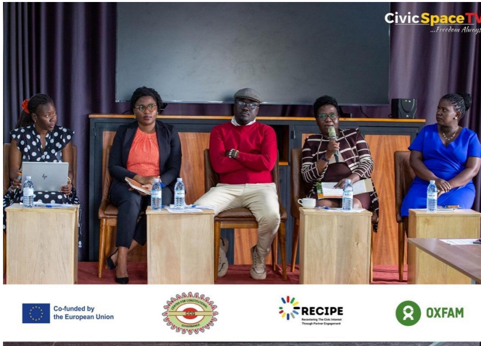
A panel session at the DRIF debrief workshop in Kampala